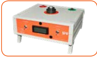
SPY® MODEL JM JEEPMEETER