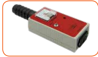
SPY® MODEL PJM POCKET JEEPMEETER

Please call our office at (713) 681-5837 or email us at sales@picltd.com for more product details or to place an order.