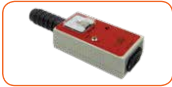
SPY® MODEL PJM POCKET JEEPMETER