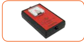
SPY® MODEL DCPJM DC POCKET JEEPMETER

Please call our office at (713) 681-5837 or email us at sales@picltd.com for more product details or to place an order.